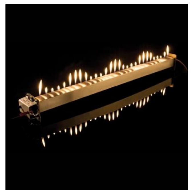
Above: Sound on fire with our Reuben's Tube demo covering the Year 8 waves topic.