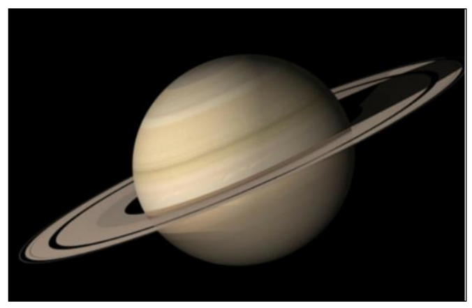
Above: We do an in-depth study of the solar system in Year 7

All pupils are given access to a large library of electronic resources which can act as lesson support, revision aids or as individual research and extension work. These are interactive and can be highly tailored to meet the individual demands of our pupils.