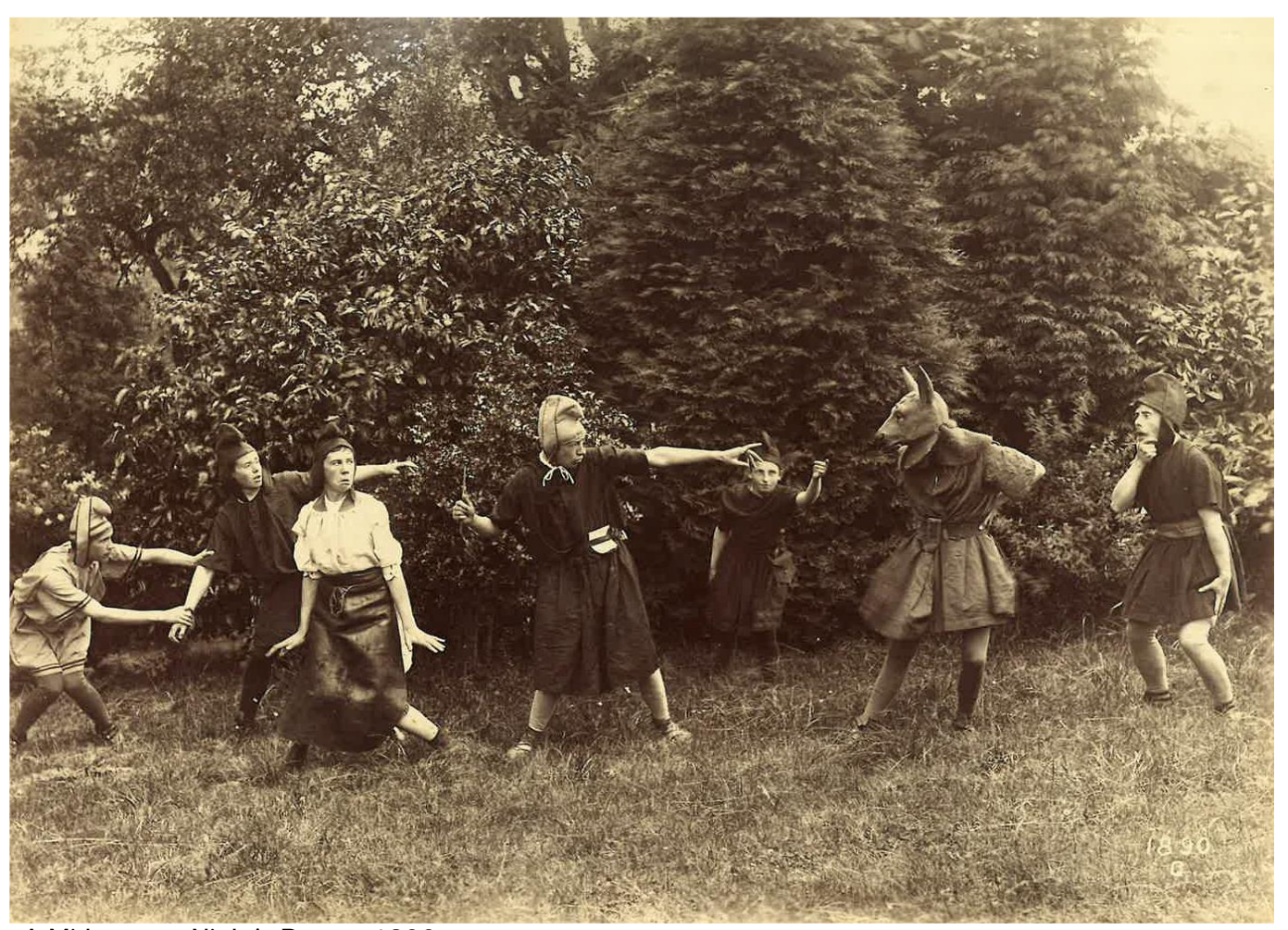
A Midsummer Night's Dream, 1890