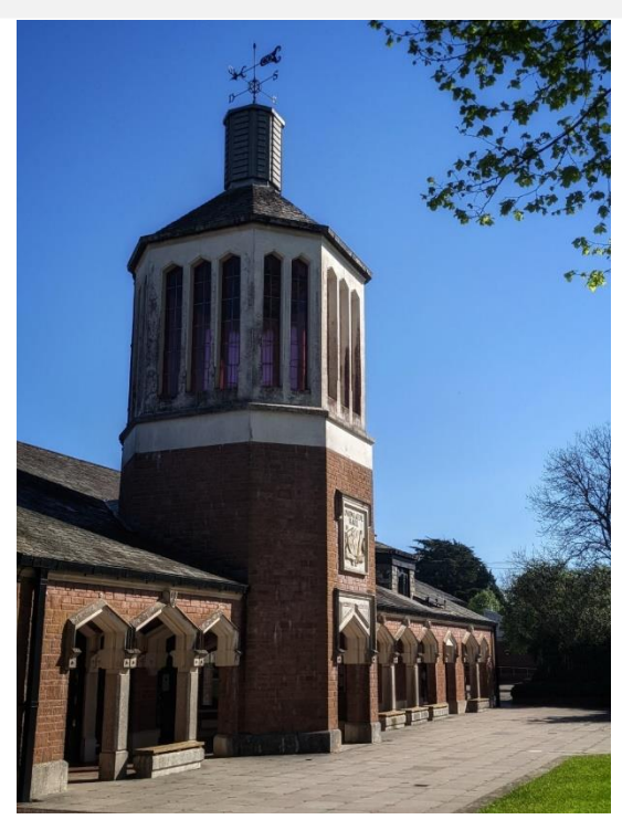
Ondaatje Building in the sunshine this week

Welcome back to Archivium . I have been so delighted with the positive response I have had, yet again, to the last edition – thank you very much for your kind emails.