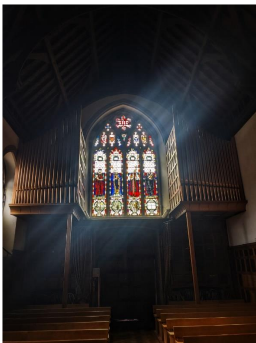
Our beautiful chapel in the early evening light