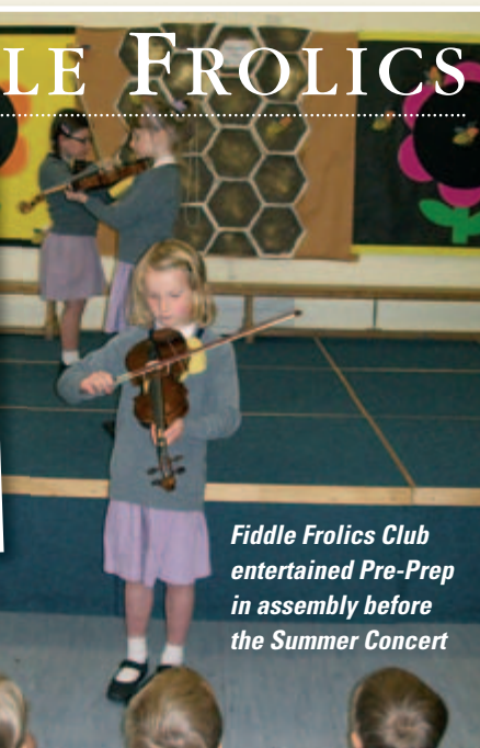
Fiddle Frolics Club entertained Pre-Prep in assembly before the Summer Concert