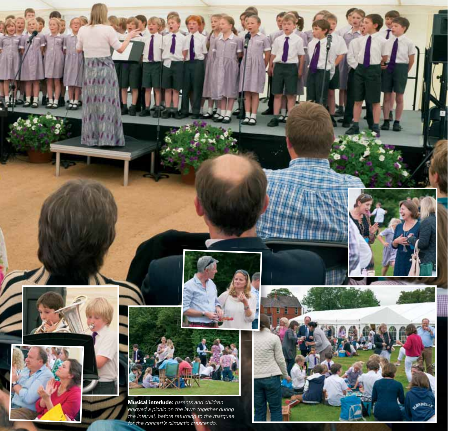
Musical interlude: parents and children enjoyed a picnic on the lawn together during the interval, before returning to the marquee for the concert's climactic crescendo.