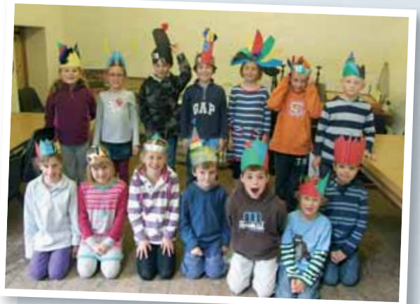
Head over heels: Year 3 with Olympic head wear at Beaford Arts Centre.

own art aprons which looked fantastic! The following day, after a good night's sleep(?) they headed off to Broomhill Sculpture Park where they studied some amazing sculptures and then tried out their own sculpting skills on the beach at Saunton Sands.