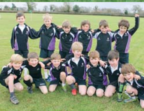
Above: The U7 Football team enjoyed travelling to St. Peter's for a first shot at competitive football away from home.