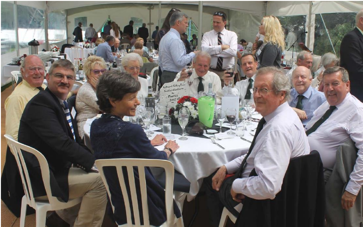
The Magpies and friends in summery mood around the Chevithorne 'falling plate'. What have we got to be thankful for? A great deal...