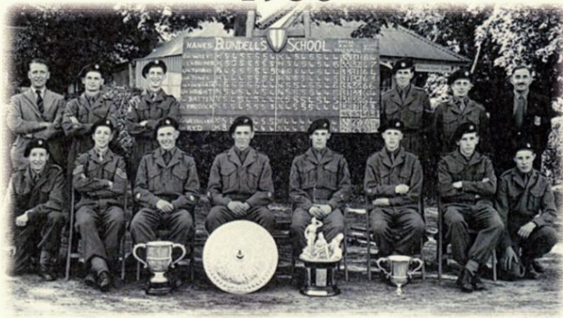
Snap, Rapid, Marling, Grand Aggregate, Ashburton Trophies