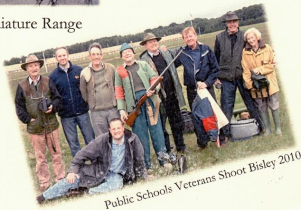
Public Schools Veterans Shoot Bisley 2010