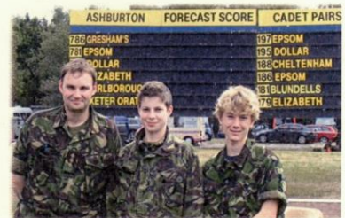
The last young hopes 2010