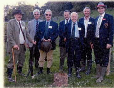
Chevithorne Range revisited, we find the Plate 2010