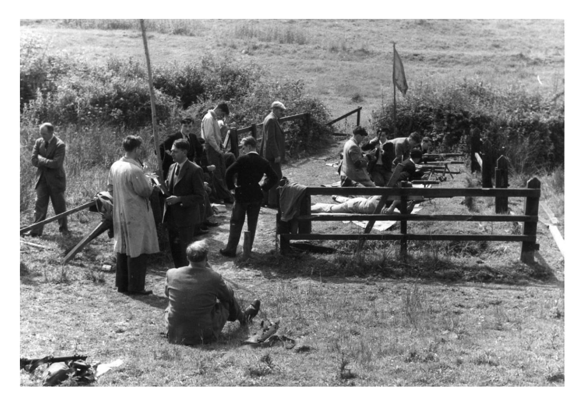
Who, when, where?

Magpies on 7th May in Normandy, celebrating on the eve of VE Day.