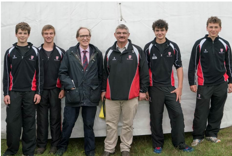
7. Group of keen young fellows, one and all.