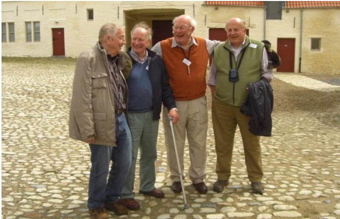
6. Group of seasoned characters (planning their next heist?).