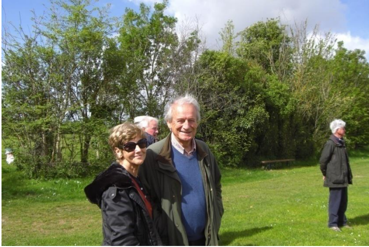
5. M. Le President visite des champs historiques.