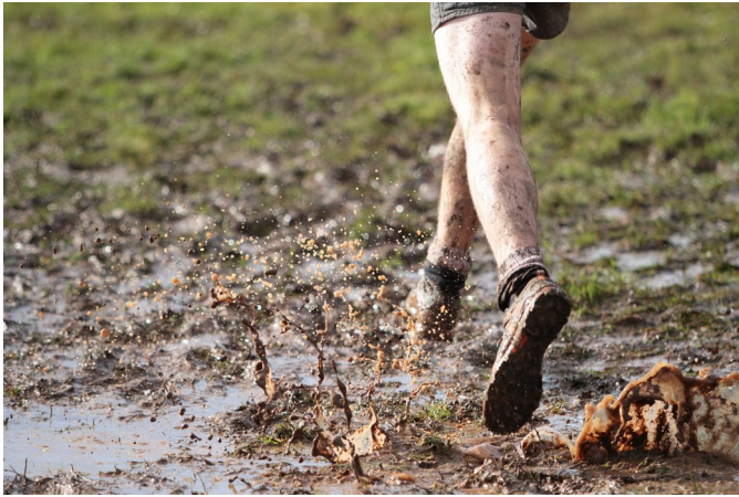
Above: A wet Russell