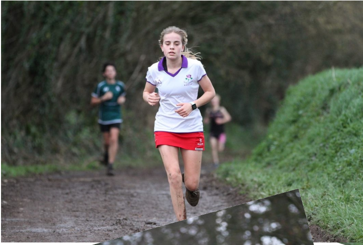
Photos clockwise from below: Russell 2022, SH 1924, Russell 2021, Russell 1948, Russell 2022, Russell 2022, Russell 2021