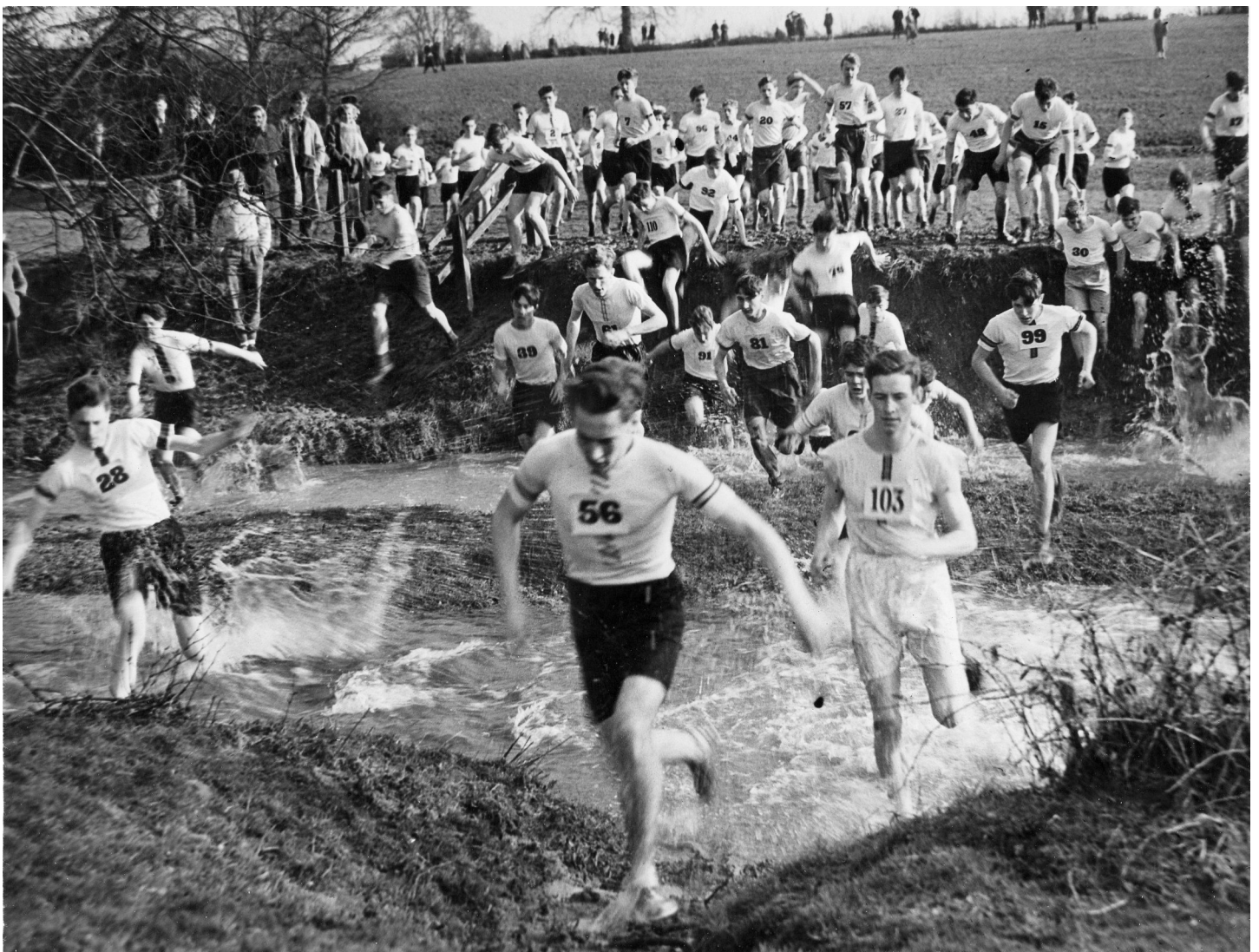
Open Russell - Crossing the River Lowman 1951