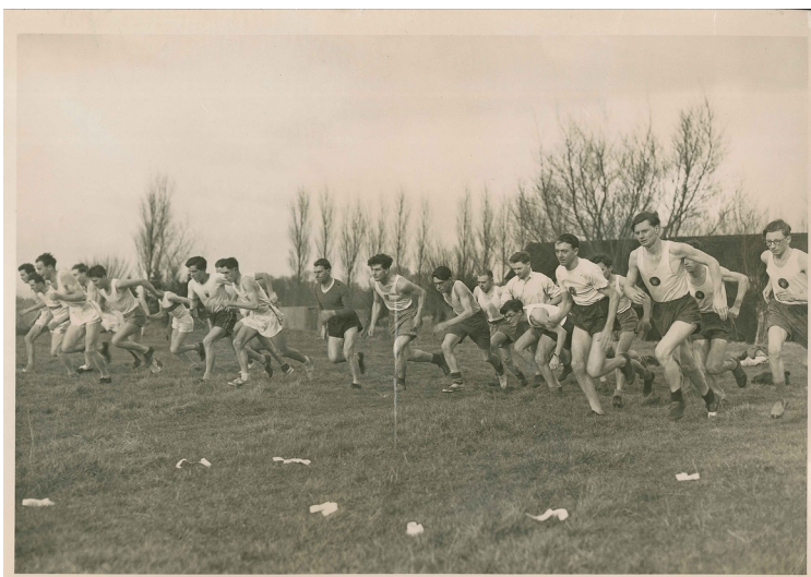
Left: Russell 1948

Individual trophies are presented to the winner of each race, plus a cup for 'Second to the Russell'. There are also team competitions taking place comprising teams formed from the Boarding Houses. In addition, there is the Berry-Barker-Ballance-Cup for Endeavour . This is awarded to the runner who has made the most spirited effort and improvements in their fitness over the years.